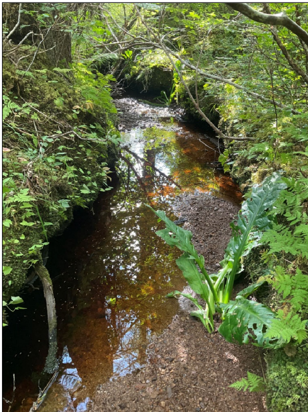
Figure 2.—Upstream view of stream No. 114-31-10100-2020 at waypoint 1585.