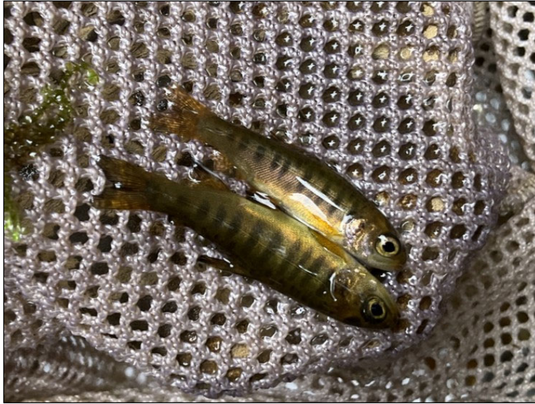
Figure 1.—Juvenile coho salmon captured at waypoint 1581.